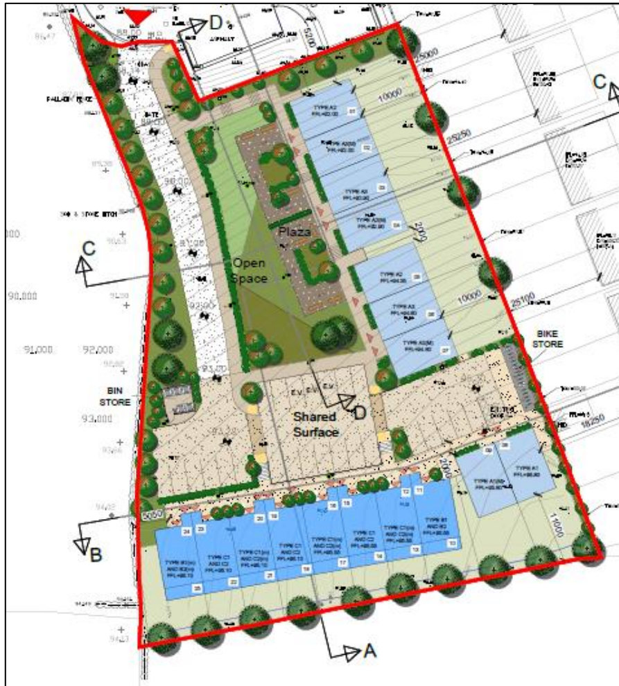
Figure 2 Site Plan prepared by Deady Gahan Architects.