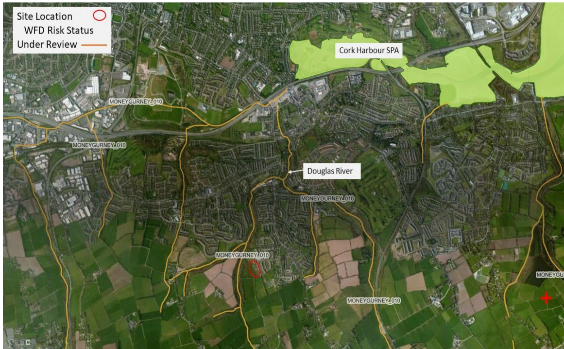
Figure 6 Site location and WFD status of watercourses in proximity.

The water quality of Lough Mahon, a transitional water body which forms part of Cork Harbour SPA, was determined from the EPA Interactive Mapviewer 3 . The Water Quality status for 2018 – 2020 was determined to be “eutrophic”, while the Water Framework Directive (WFD) status for the period 2013 - 2018 is identified as “Moderate”, and “At Risk” of not achieving good status.