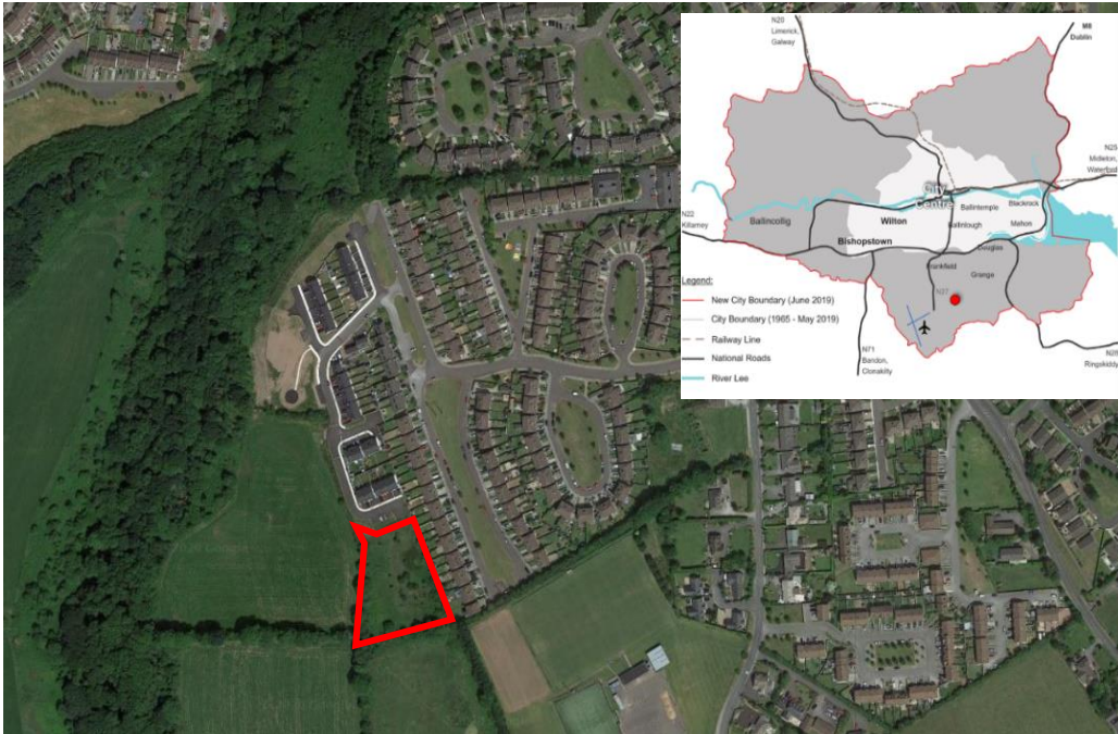
Figure 1 Location and boundary of subject site outlined in red