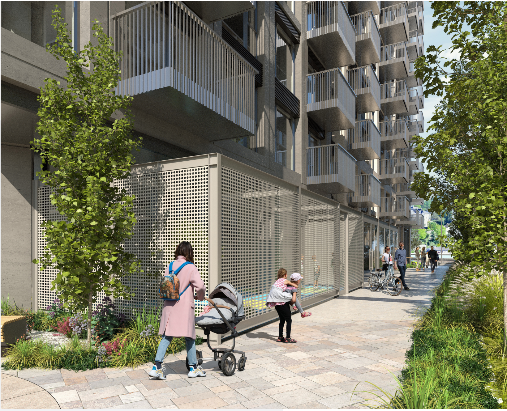
EASTERN LANEWAY VIEW

ALL DIMENSIONS TO BE CHECKED ON SITE NO DIMENSIONS TO BE SCALED FROM THIS DRAWING DRAWING IS TO BE READ IN CONJUNCTION WITH RELEVANT CONSULTANTS DRAWINGS ALL MEASUREMENTS ARE METRIC. ALL LONGITUDINAL MEASUREMENTS AND SELECTED VERTICAL SEPARATION DISTANCES IN MM (x4020). ALL VERTICAL REFERENCE HEIGHTS IN METRES (D) (x+27.600). ALL FFL IN METRES OF (x+3.800).