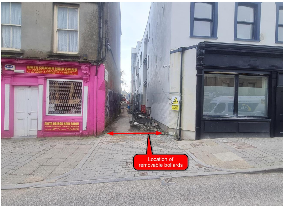
Figure 2: Road closure on junction with Barrack Street