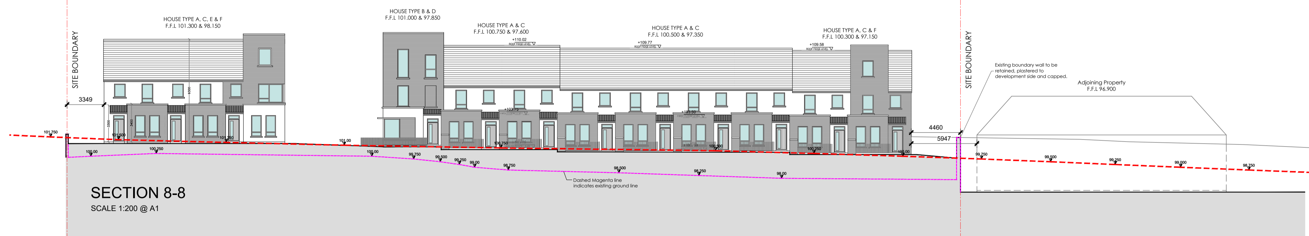
SECTION 8-8 SCALE 1:200 @ A1