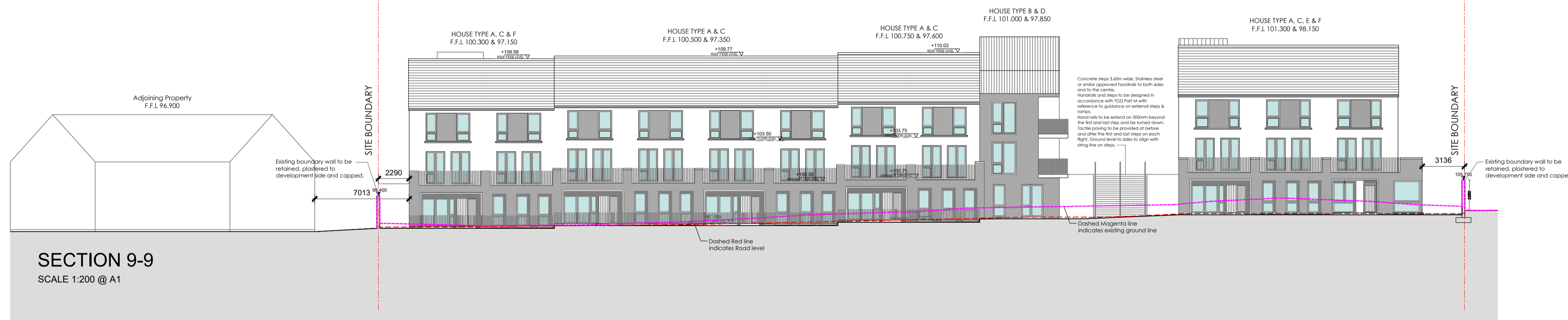
SECTION 9-9 SCALE 1:200 @ A1