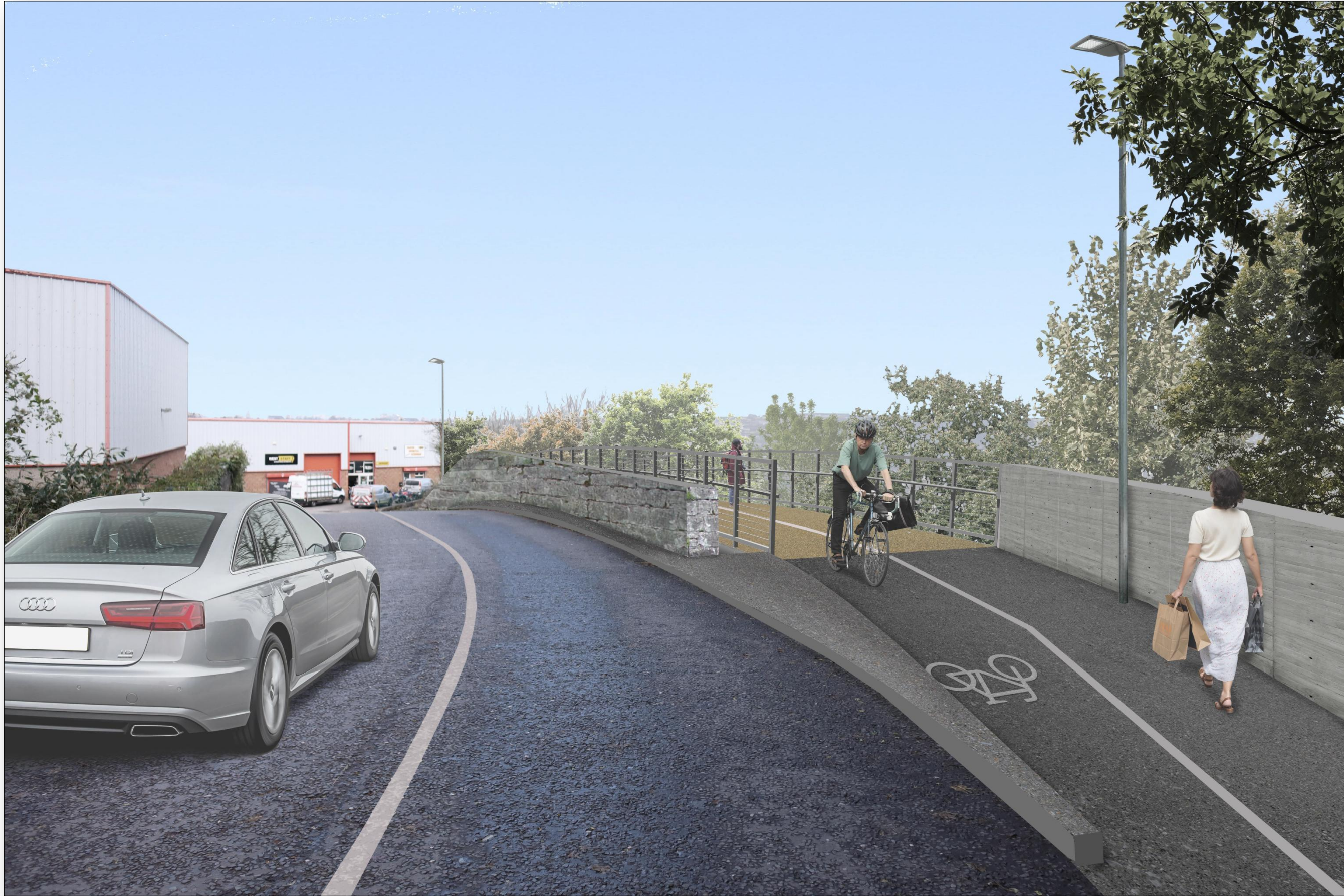
View of Proposed Pedestrian Cycle Bridge Adjacent to Existing Stone Bridge (Looking North).