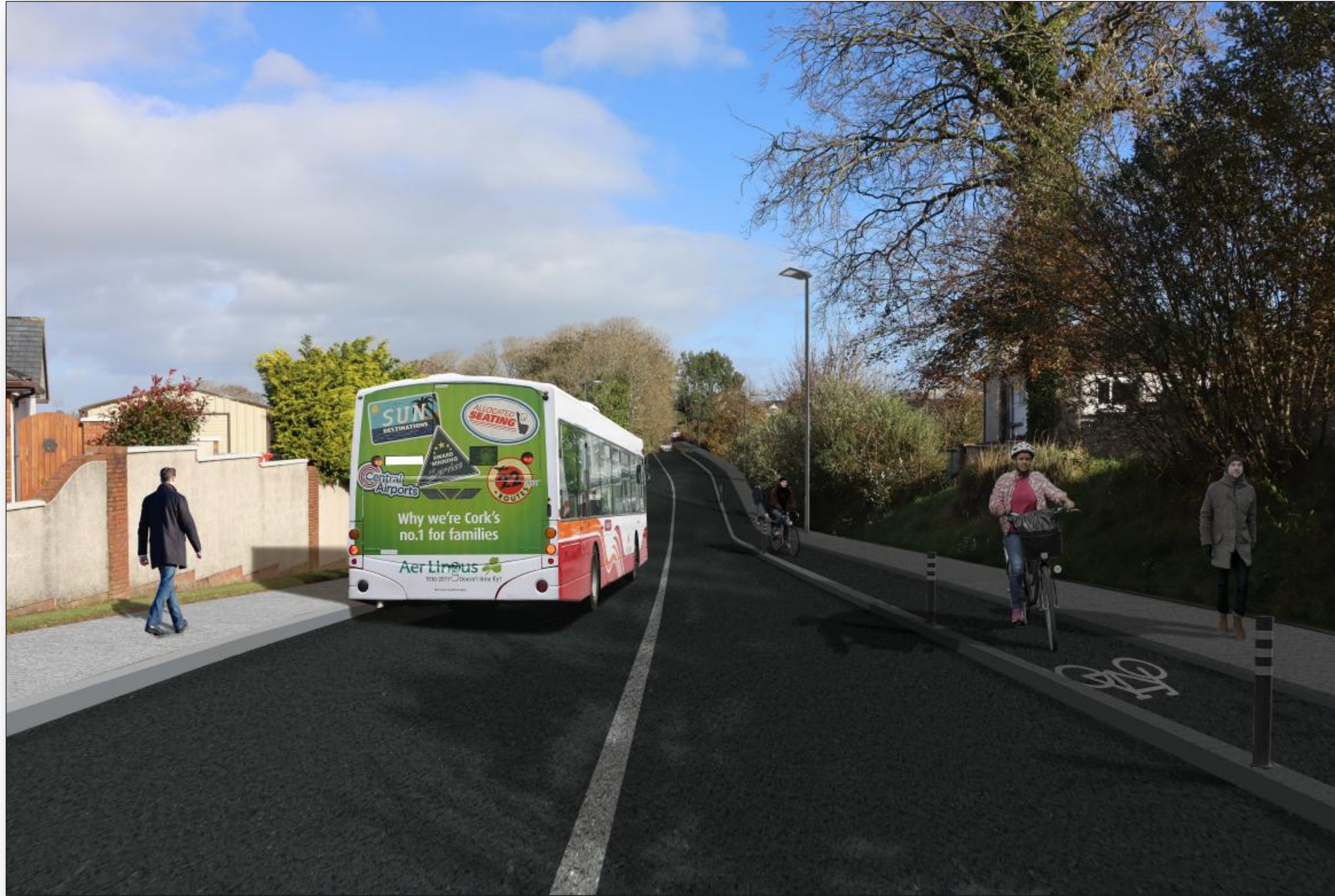
View of the Proposed Typical Road Cross-Section at Laurel Brook (Looking North).