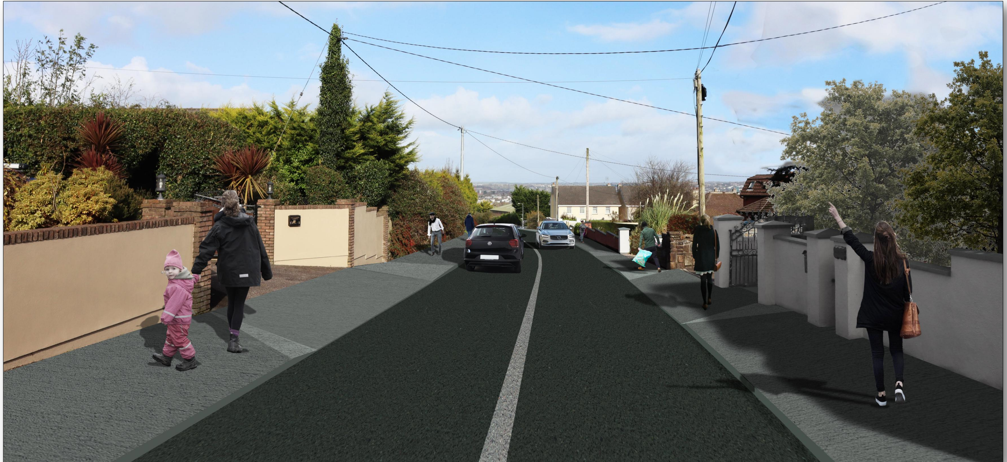
View of Proposed Typical Cross-Section on Togher Road (Looking North).