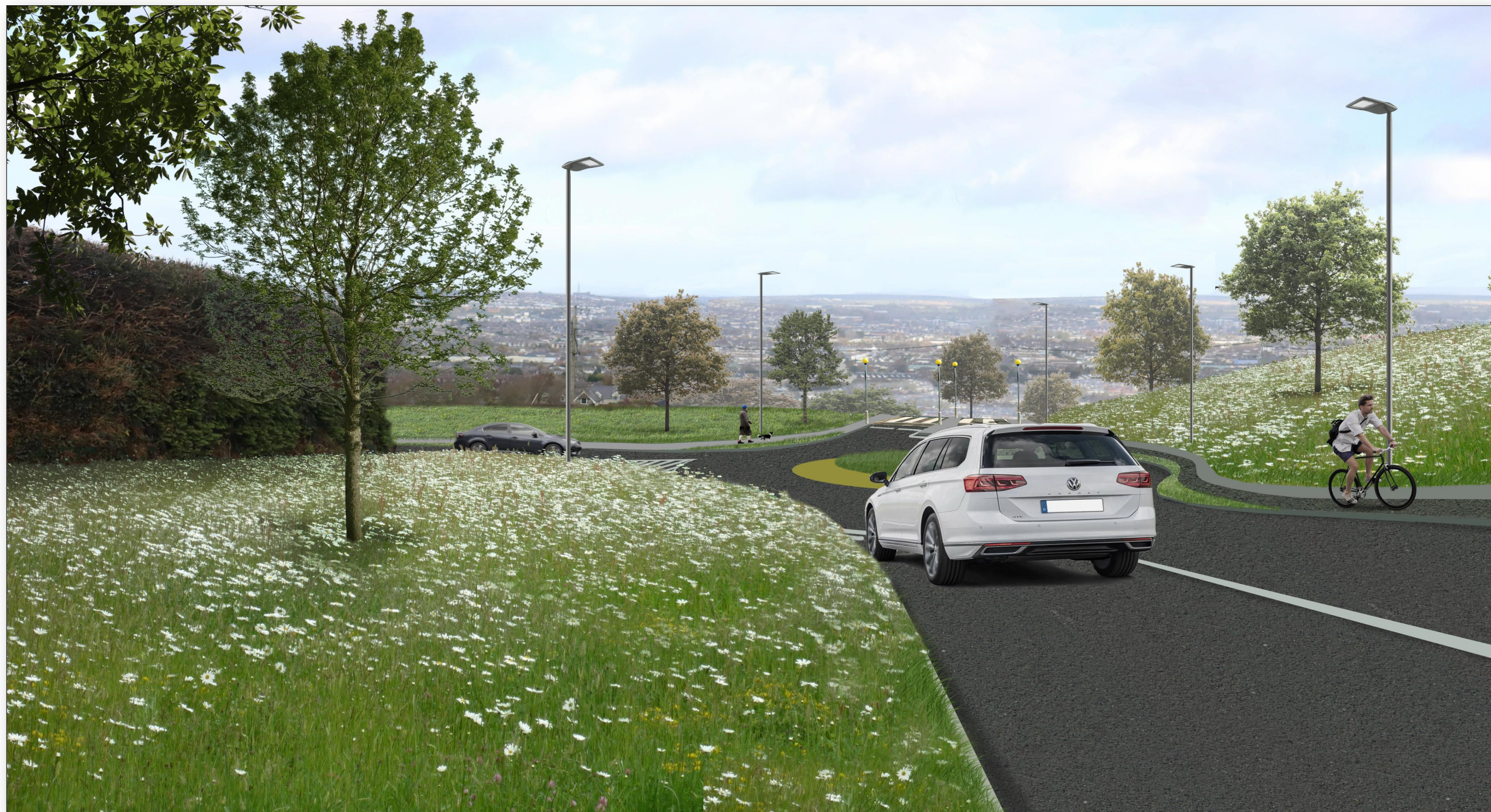
View of Proposed City Gateway at Barretts Junction (Looking North).