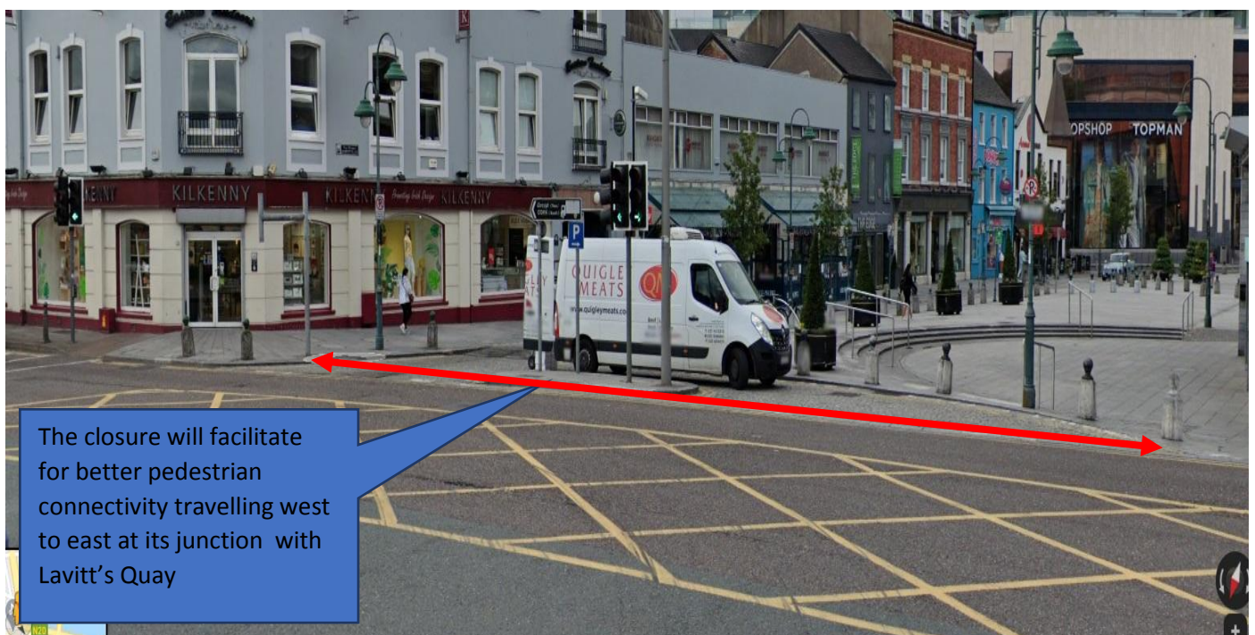
Figure 5: Emmett Place from its junction with Lavitt's Quay.