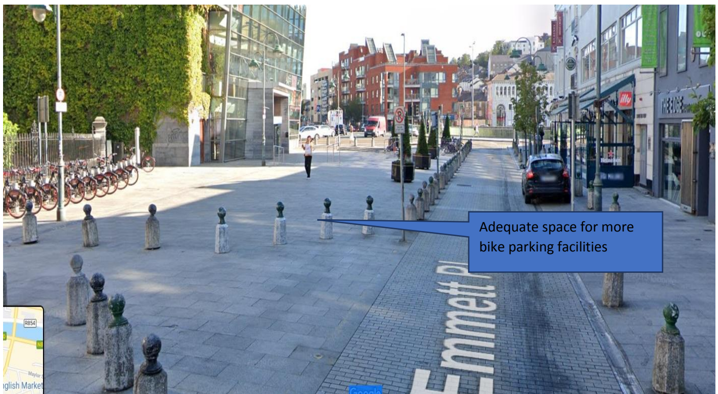
Figure 3: Emmett Place large pedestrian area in prime city centre location