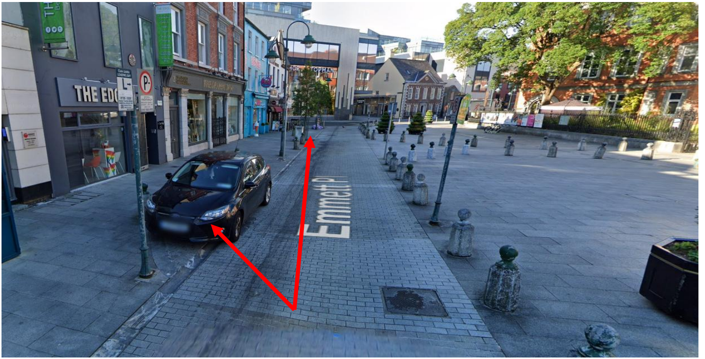
Figure 6: Loading Bays/Parking Spaces on Emmett Place (source Google Maps).