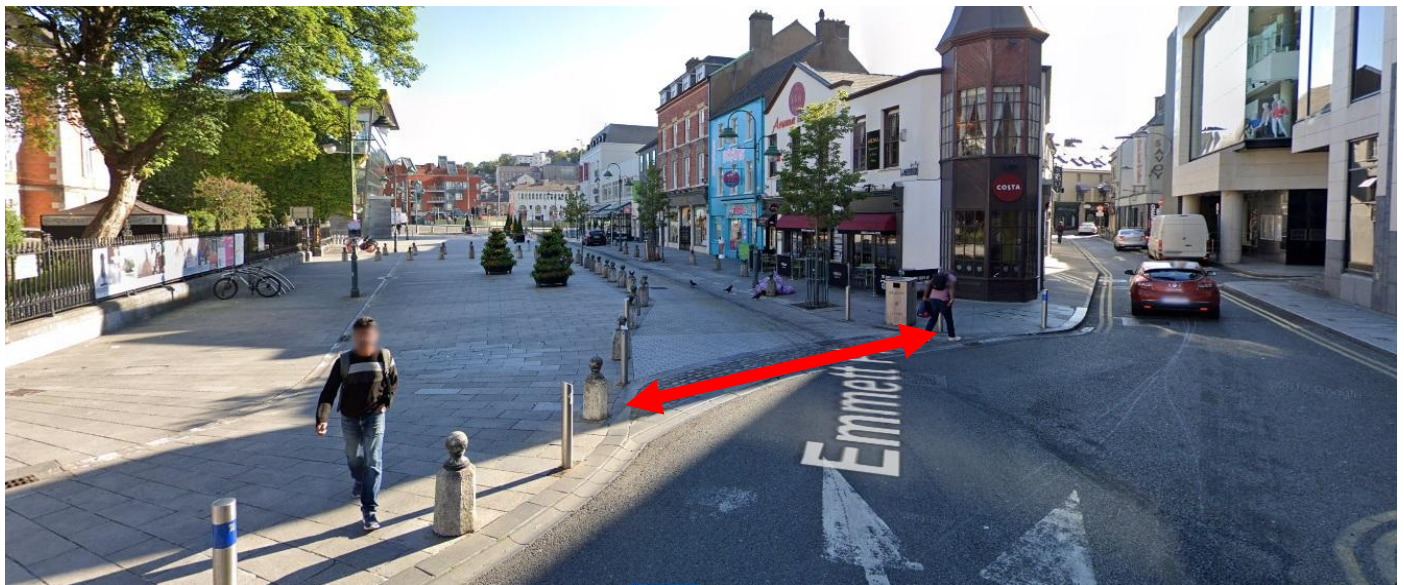
Figure 2: Road closure indicative location at junction with Drawbridge Street