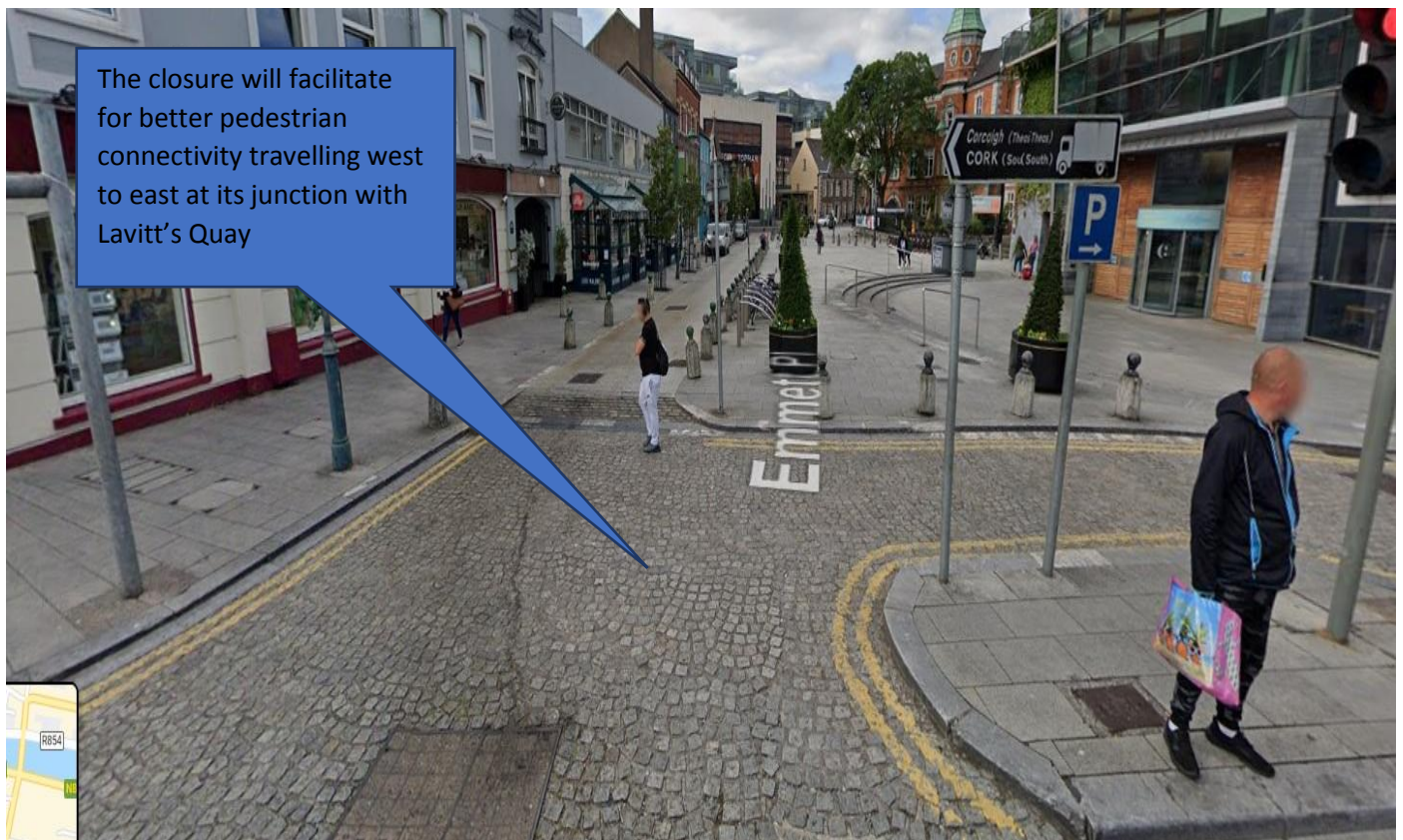
Figure 4: Emmett Place from its junction with Lavitt's Quay.