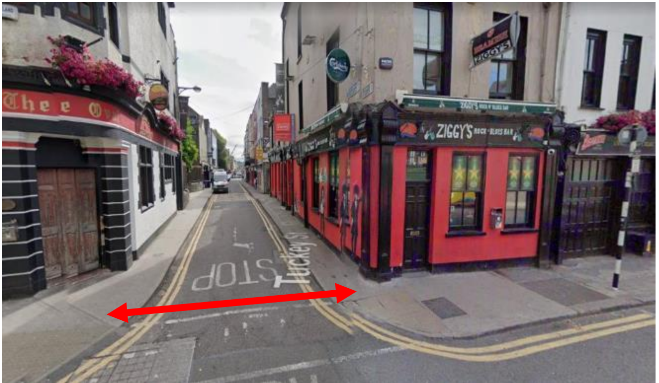
Figure 3: Road closure indicative location at junction of South Main Street