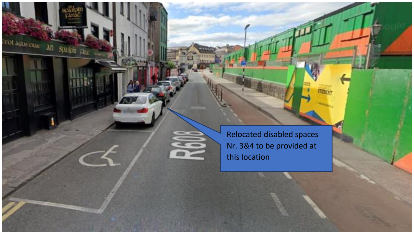
Figure 7: Second set of relocated disabled spaces on South Main Street