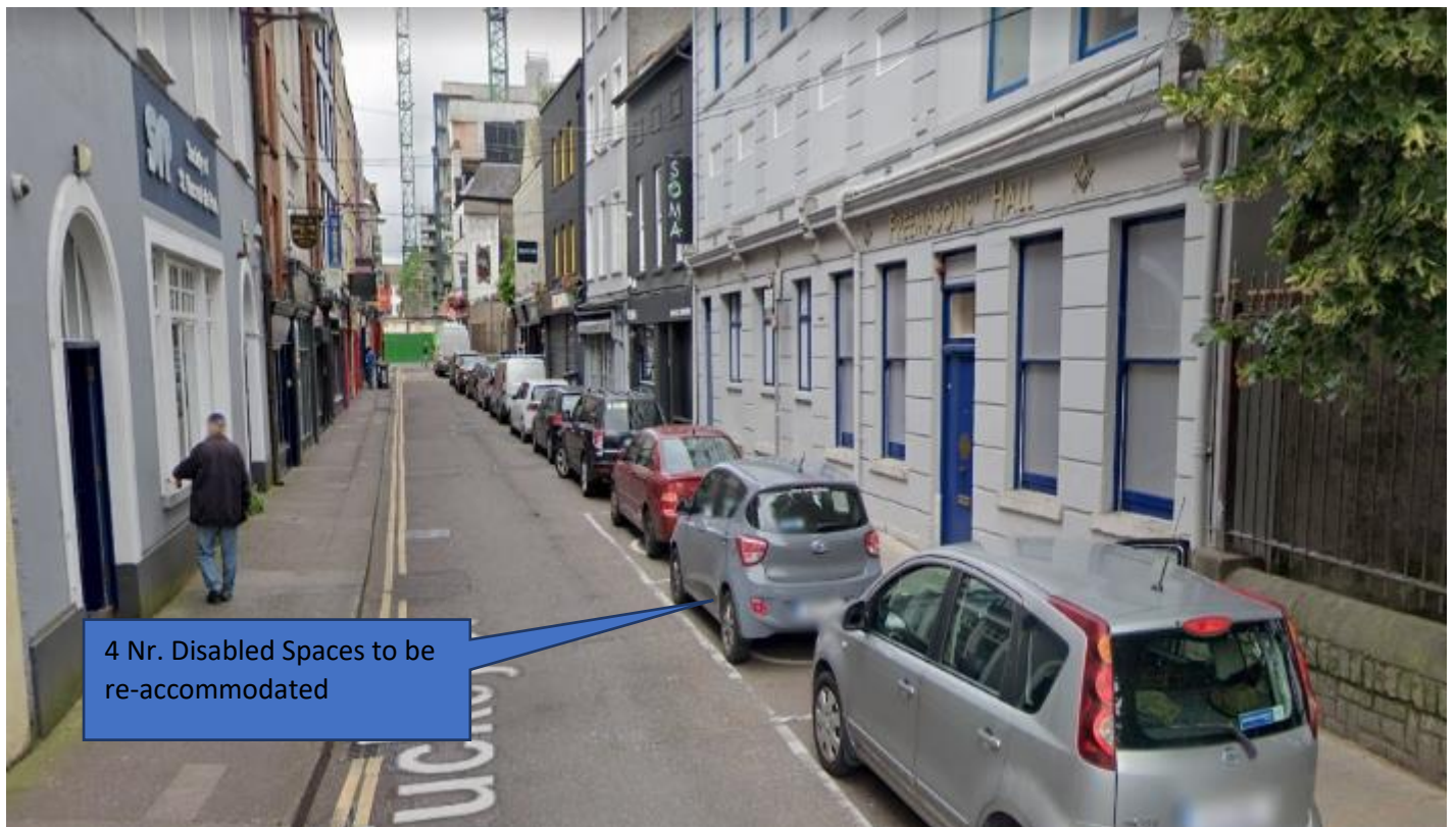
Figure 4: Four number disabled spaces to be temporarily re-accommodated