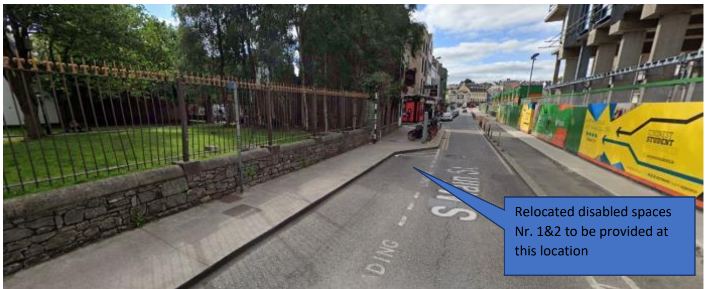
Figure 6: First set of relocated disabled spaces on South Main Street