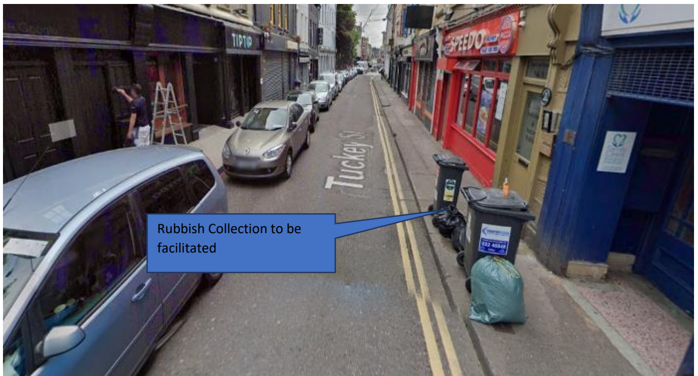
Figure 5: Rubbish collection will have to be facilitated