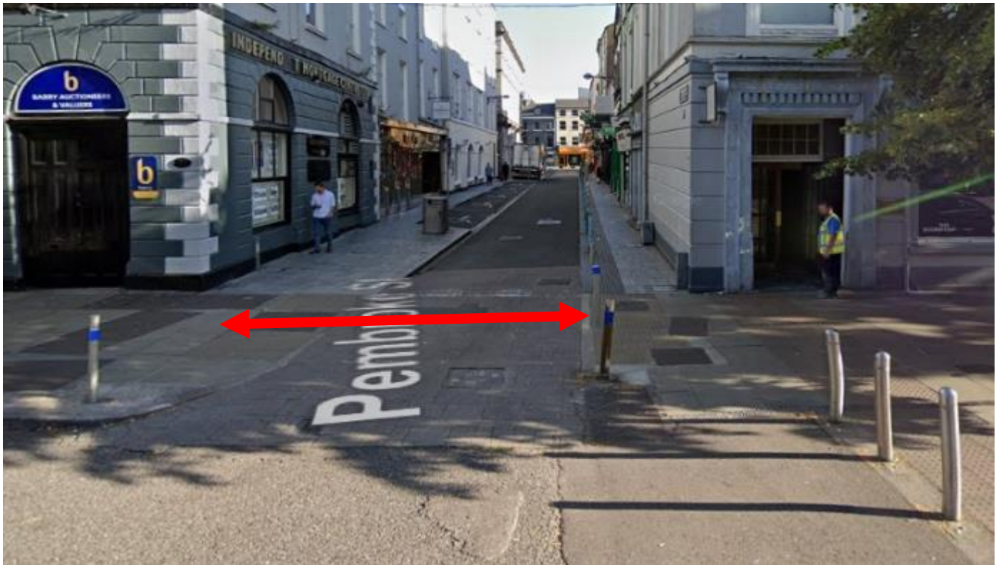
Figure 2: Road closure indicative location at junction with South Mall