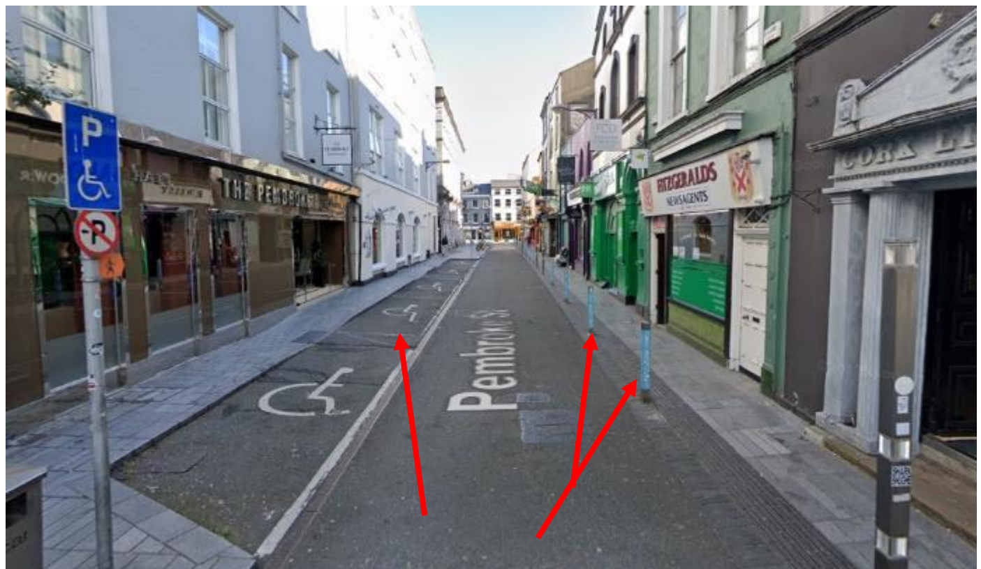
Figure 3: Five number disabled spaces to be temporarily re-located & removal of bollards on RHS to facilitate wider footpath