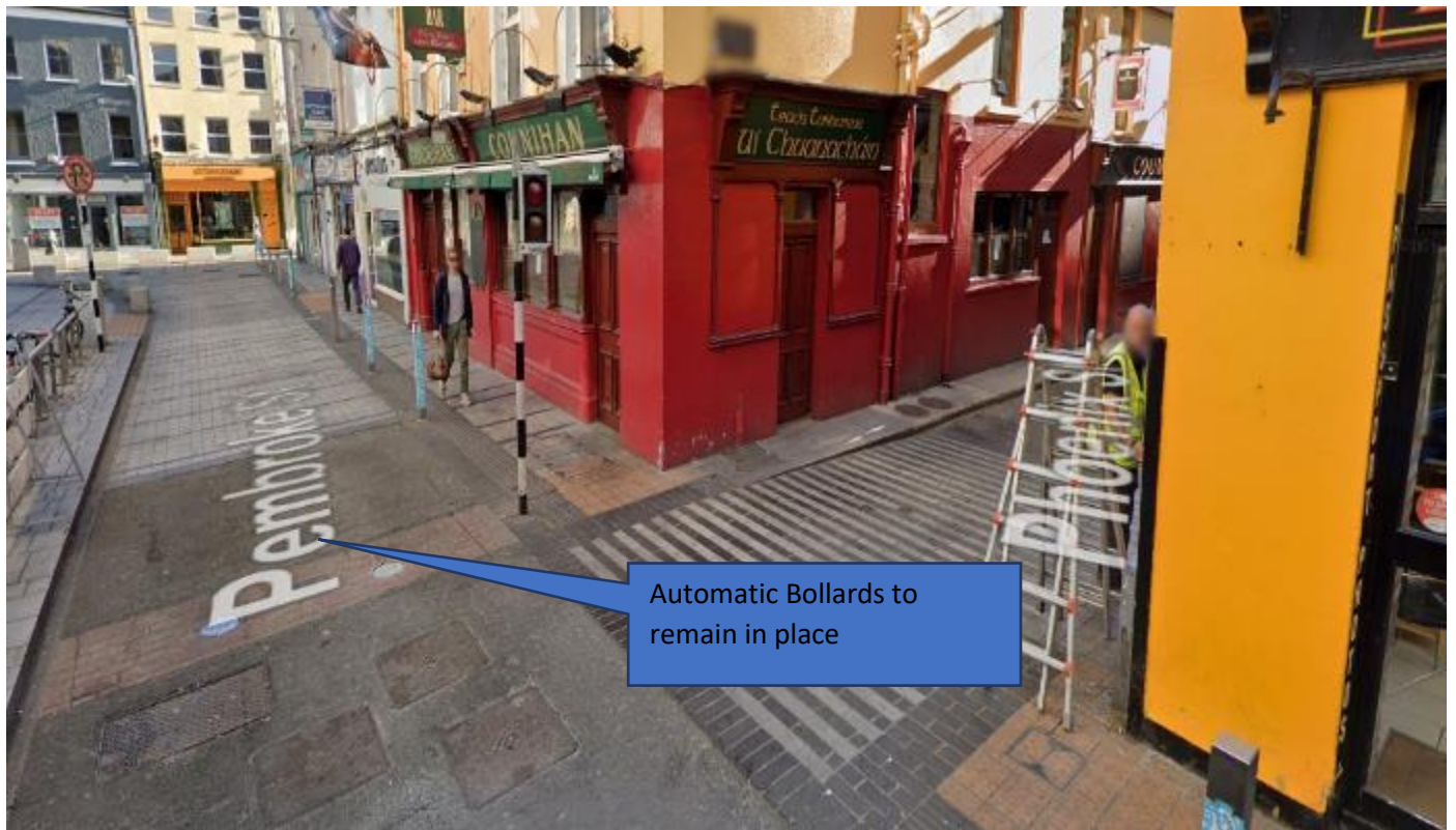
Figure 4: Automatic Bollards to remain in place. No vehicular access to Crane Lane for duration of closure.