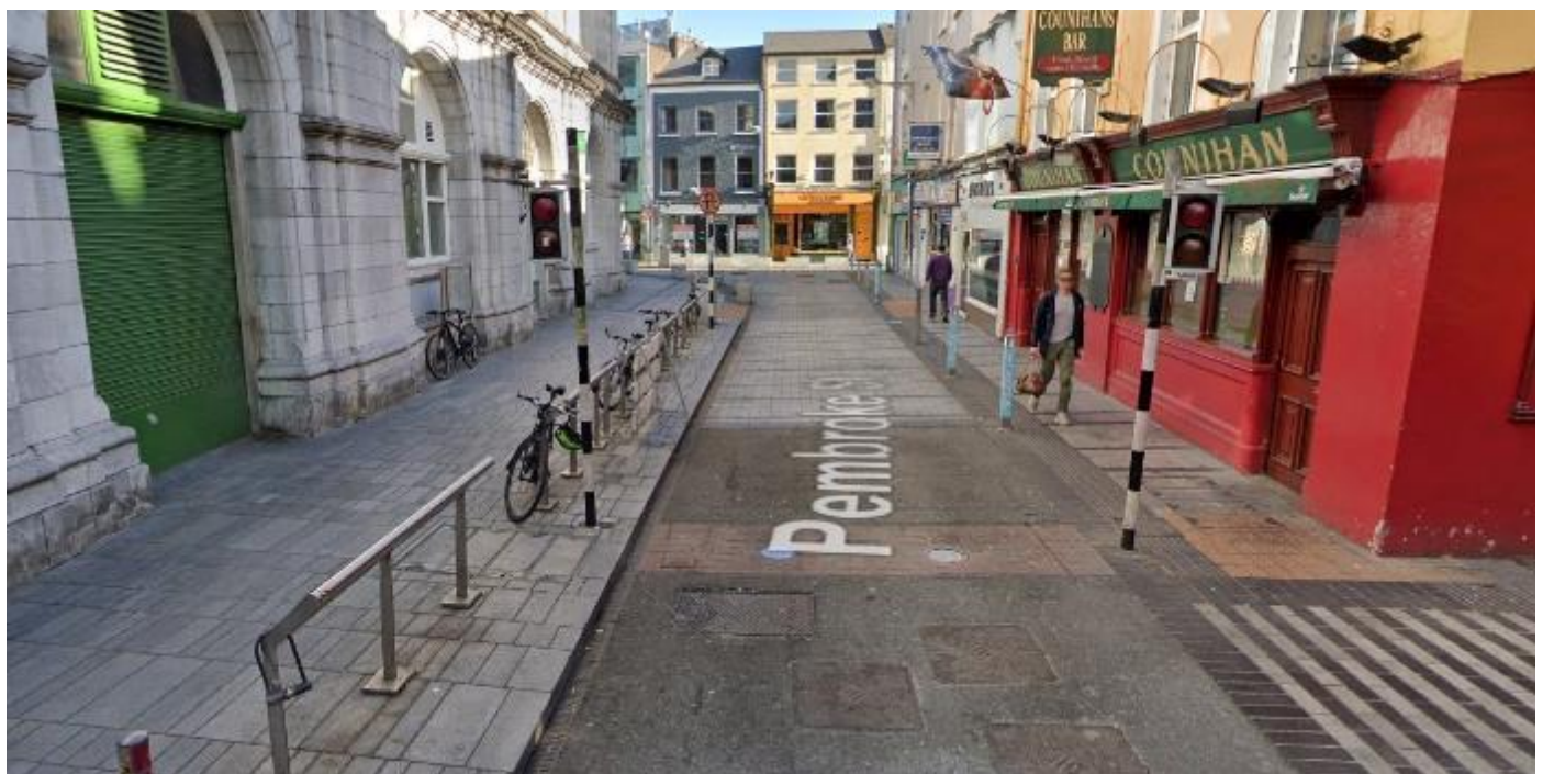
Figure 5: Cycle Rack facilities on Pembroke Street.