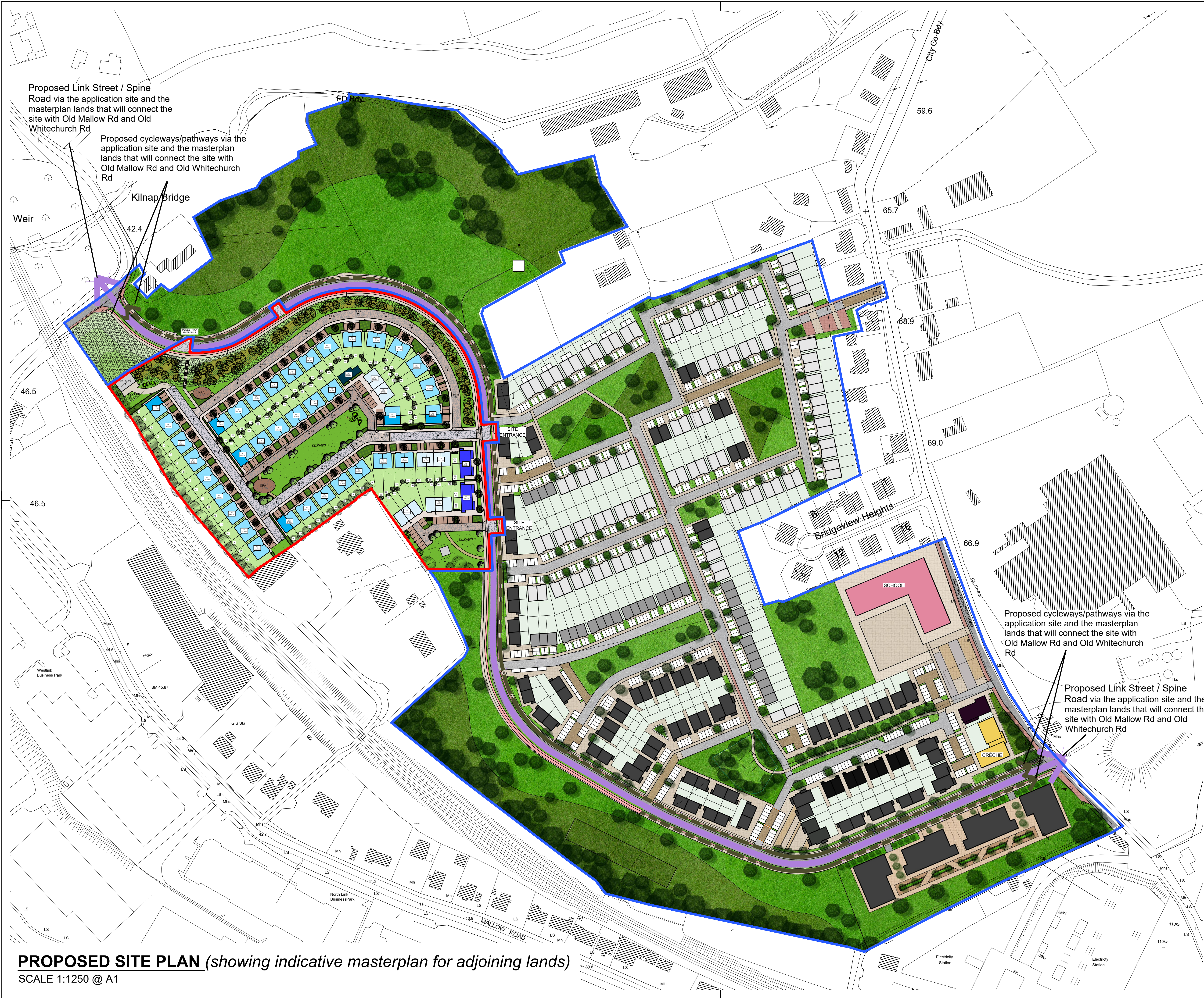
PROPOSED SITE PLAN (showing indicative masterplan for adjoining lands) SCALE 1:1250 @ A1

DO NOT SCALE. WORK TO FIGURED DIMENSIONS ONLY. ALL EXISTING DIMENSIONS TO BE CHECKED ON SITE. DRAWN ON AUTOCAD R2004 AT DEADY GAHAN ARCHITECTS LTD LAYERS ON THIS DRAWING COMPLY WITH BS 1192: PART 5