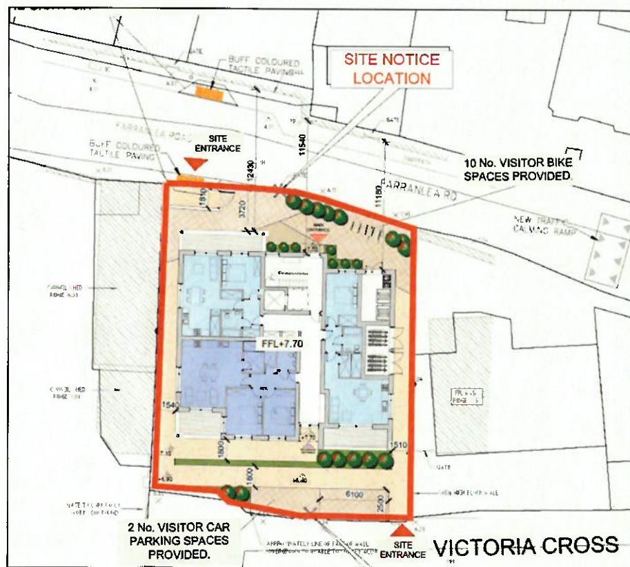
Figure 3 Proposed Site Layout prepared by Deady Gahan Architects

It is proposed to connect to the existing foul sewer and water supply. The 2022 Annual Environmental Report (AER) for the Carrigrennan Wastewater Treatment Plant (WWTP) which serves the Cork City agglomeration. The AER states that the WWTP has a plant capacity PE of 413,200, the treatment type is 3P - Tertiary P removal and that the capacity of the WWTP will not be exceeded in 3 years. 1