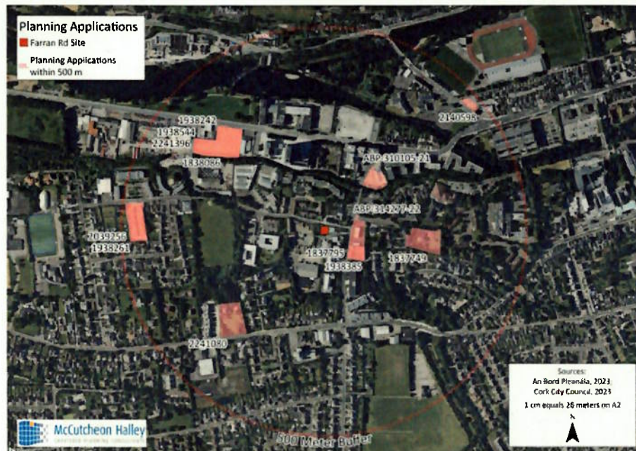
Figure 5 Site location in context of permissions adjoining the site

It is considered that the proposed development will not impact, directly or indirectly, any of the habitats or species listed as features of interest for Cork Harbour SPA. In the absence of any potential impacts due to the proposed development there is no pathway for other plans and projects to act in-combination giving rise to cumulative impacts.