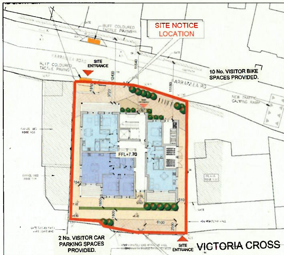
Figure 2 Site Layout prepared by Dedy Gahan Architects